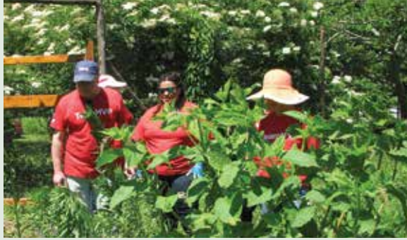
Employees from Team MVP spent an afternoon caring for our garden at Sugar Hill Farm. All harvested fruits and veggies will be donated to the Community Center of Northern Westchester.